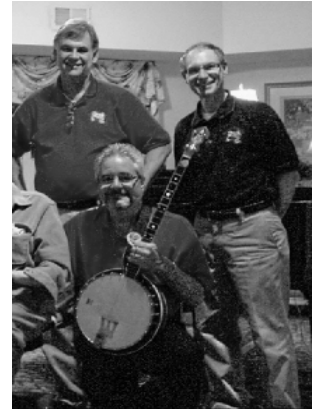
The "Trinity Trio" will play at the dinner on Sat., January 14th